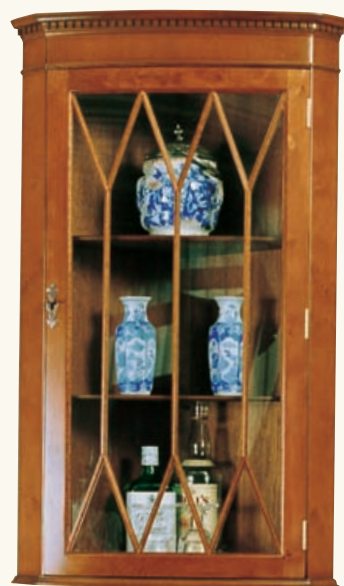
TE14 Hanging Bow Front W 56cm 22" H 103cm 40" D 41cm 16"