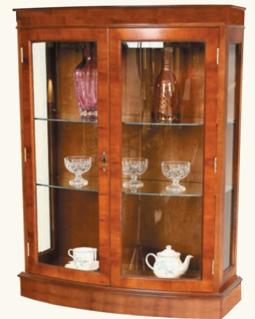
TD14A 2 Door Bow Fronted Display W 84cm 33" H 112cm 44" D 36cm 14"