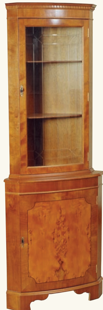
TE4XC Bow Front Crystal Cut Glass W 66cm 26" H 183cm 72" D 46cm 18"