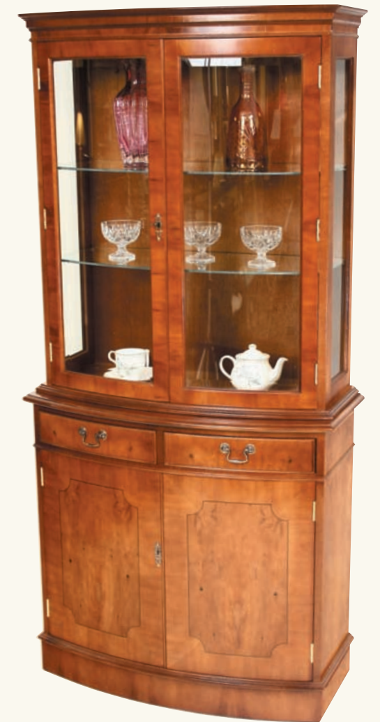
TD19 Bow Fronted Display Cupboard W 84cm 33" H 178cm 70" D 40cm 16"