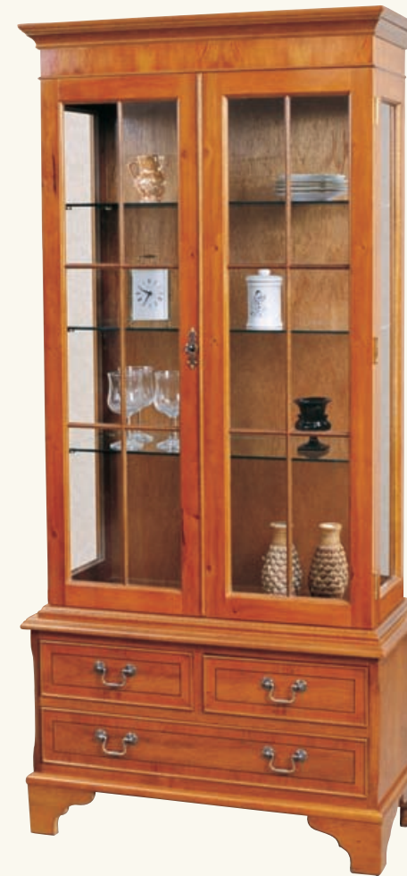
TD14 Display Chest W 76cm 30" H 160cm 63" D 35cm 13½"