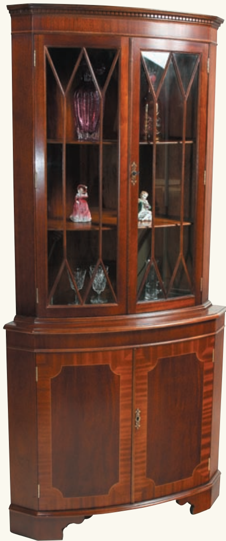
TE10 Double Bow Front Corner W 92cm 36" H 183cm 72" D 61cm 24"