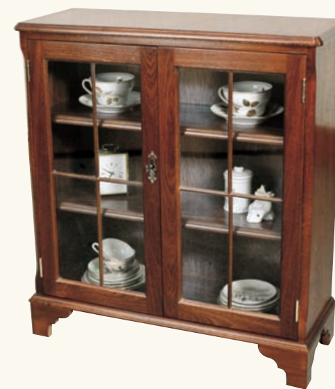
TD15A Low Display Cabinet W 79cm 31" H 87cm 34" D 31cm 12"