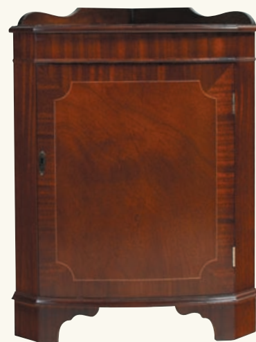
TE16 Bow Front Corner Base W 66cm 26" H 79cm 31" D 46cm 18"