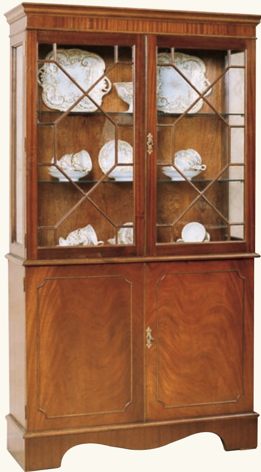
TD13 Display Cabinet Cupboard W 94cm 37" H 169cm 66½" D 33cm 13"