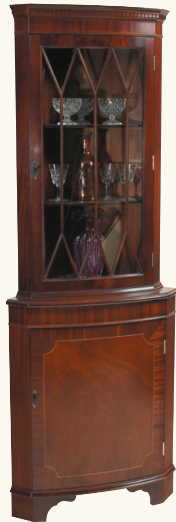
TE4 Bow Front Corner W 66cm 26" H 183cm 72" D 46cm 18"

The TE4, TE1 and TE10 differ from the TE4X (Budget Corner Unit) in that they have wooden glazing bars and more expensive veneers.