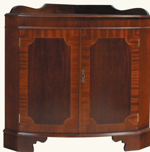
TE10B Double Bow Corner Base W 92cm 36" H 79cm 31" D 61cm 24"

All cabinets should be fixed to the wall.